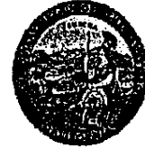
ARNOLD SCHWARZENEGGER Governor